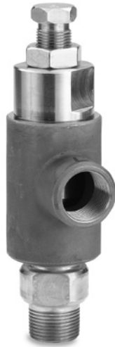
Model 890710 Shown

Standard Models: 1" 890710, 890711, 890712, 890714 2" 890703, 890713, 890715