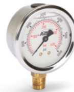
Pressure Gauge PN 6088 0 – 3000 PSI